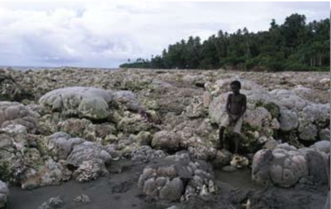
"Solomon Islands April 2007: A severe earthquake lifted islands and reefs out of the water, and deprived local villages of their prime fishing areas."